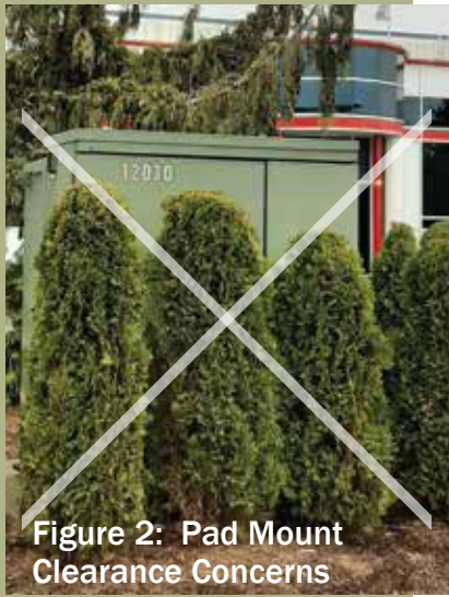
Figure 2: Pad Mount Clearance Concerns