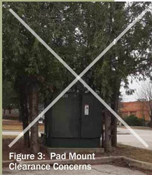
Figure 3: Pad Mount Clearance Concerns