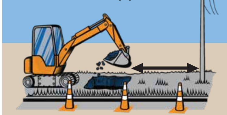
Figure 5: Contractor Excavation Near Electrical Equipment

See ESA's "Guideline for Excavating in the Proximity of UG Distribution Lines" www.esasafe.com and contact NT Power for guidance before excavation in the proximity of electrical infrastructure.